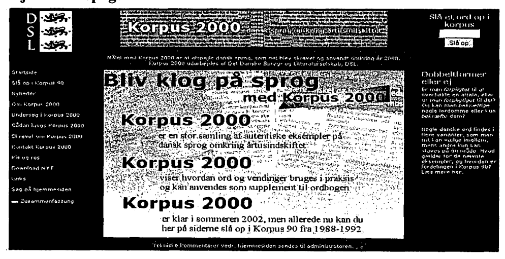
Figure 2: The Korpus 2000 homepage